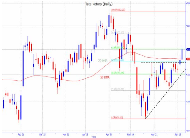
Short Term: Upto 1-Week; Medium Term: Upto 1-Month; Long Term: Upto 6-Mths